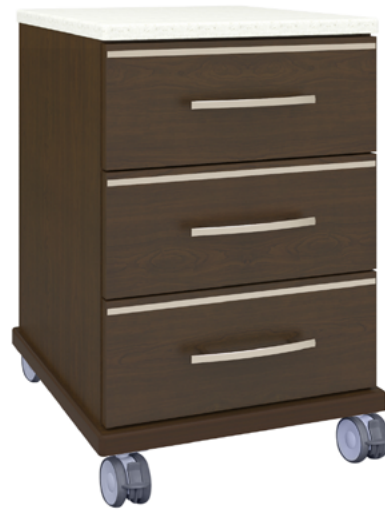
Model: HLBS30HCCT 21W 19D 30H

Kwalu's Hollywood Mobile Cabinet with Corian® top is designed exclusively for the healthcare market. The Hollywood collection is defined by clean lines and 3/8" brushed aluminum inlays. The cabinet base design is made of thicker panels for stability. Gently rounded corners and tops with a 3/8" edge banding and bullnose profile eliminate sharp edges. Styles included a 1 door, 1 drawer and a three; both with 3" twin wheel front locking Tente casters. Drawer liners and Corian® top are optional. This product is designed for personal items and supplies. It is not intended for clothing storage.